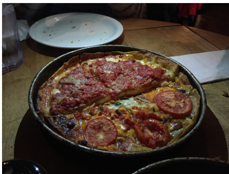
Deep Dish Pizza @Lou Malnati's

One thing people know about America is America is huge country. I would tell my journey abbreviated since I tried to travel as much as I could thus I have been to Minneapolis, MN, Chicago, IL, Las Vegas, NV, Los Angeles and San Francisco, CA and New York, NY. Starting with Minneapolis where it took about four-hour drive from Fargo. Minneapolis Sculpture Garden is one of attraction in Minnesota and we could not ignore the Mall of American in Bloomington claimed as the biggest mall in America. I went there with friends by Greyhound bus and stayed for one night at the hotel. Secondly, I have heard about Amtrak train in the US and Thanksgiving was the right time for us taking it to Chicago and spent our 4-day holiday. We watched McDonald's Thanksgiving Parade, had deep dish pizza at Lou Malnati's, rode Tilt at John Hancock Observatory, walked around downtown and China town and went shopping on Black Friday.