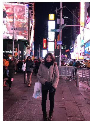
New York Times squares