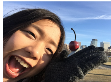
Minneapolis Sculpture Garden,