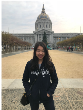
City Hall, San Francisco