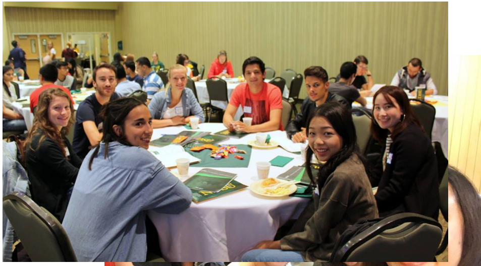
Orientation day @ Memorial Union

The first day in school was an orientation day provided by NDSU international office. There were actually two days for orientation. To make it easier to understand, I would say the first day was formal which they introduced you about all important issues including immigration, course registration, working opportunities for international students, safety, accommodation, dining service, facilities and other services. The second was informal or getting to know others day. They let group of students called “I-CORE” team take all new international students to every place around campus in order to explore campus deeply. The orientation day for me was the perfect day to find new friends.