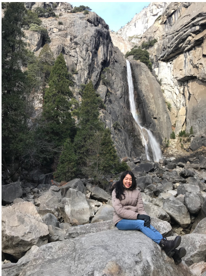
Yosemite National park