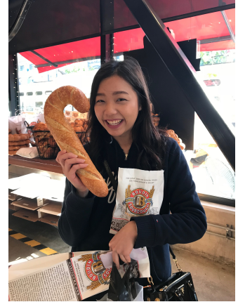
Boudin Bakery, San Francisco