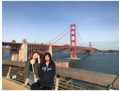
Golden Gate bridge, San Francisco