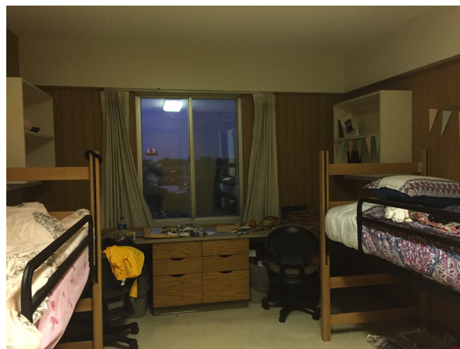
Pavek Hall: room for two students

After the semester ended, I travelled before I got back to Thailand and I will talk about my trip later. For my return flight from America to Thailand, I took Korean Air from John F. Kennedy Airport(JFK), New York and transited at Incheon Airport(ICN) same as the previous one. Unfortunately, my flight from JFK was delayed as a result of blizzard for thirty-six hours and I stayed overnight at JFK and slept on the floor. It was not good experience but it was 'new' and I would recommend people do not find from east coast of America in winter. after fifteen-hour flight, the flight from ICN was delayed affected by JFK flight hence I had twelve hours before departure and I got a chance to take the free transit tour to Gyeongbokgung palace and Insadong street. It was free only for transportation or you had an option to pay seven US dollars for meal. In my opinion, you do not have to buy the meal because there is a bunch of Korean restaurants at Insadong street which is cheaper and more various. I reached Thailand on January 7,2018 around midnight and the airport was bustling for the reason that many people got home after holiday.