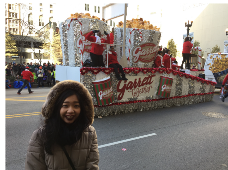
Chicago Thanksgiving Parade