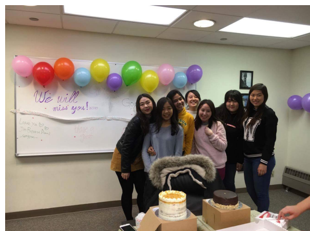
It's time to say good bye