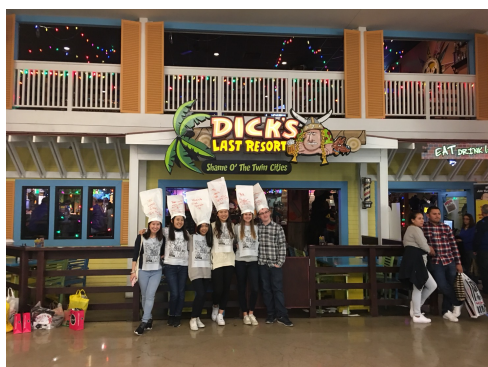
Dick's Last Resort @ Mall of America