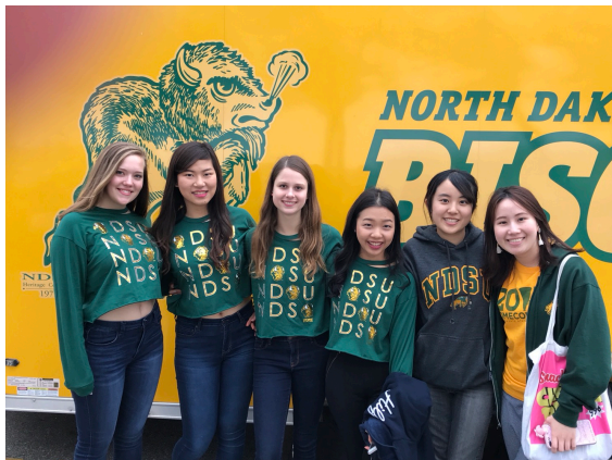
NDSU Homecoming game

The first word came up when I am think about Fargo is 'NOTHING' following by cold, dark and flat. It sounds terrible, isn't it? Anyway, how good people are can make Fargo not dull therefore the only activity you are able to do frequently is hanging out with friends. I met people from all ranges of ages and they are from different countries at Pink House which held by American family in Fargo in the purpose of gathering with people from everywhere. The meeting carries on every other Friday or some special occasions. There are diverse foods from different countries around the world along with entertainments such as board game, card game, karaoke, chatting and etc. Additionally, I noticed at that time that Fargo are full of Spanish-speaker people and not so many Asians. The number of international students at NDSU are less than ten percent accordingly it is excellent for practicing English with native speakers.