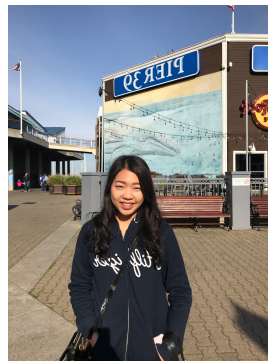
PIER39, San Francisco