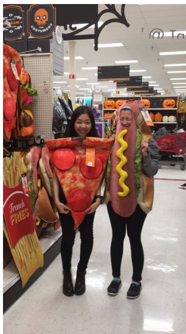
Shopping for Halloween @ Target

to me when we met outside but some were friendly and talkative. My friends I generally went out with were Asian probably because of culture and it was easier to find something in common. With Americans, I normally went to sport games like American football and basketball or some fancy restaurants. As I mentioned, I worked at dining center for two days each week and it paid around $7 after taxes per hour. As long as I was an exchange student, I needed to ask for work permission from both international office and ISEP. I went to Social security office to apply for Social Security Number(SSN) comparable to tax identification number. It made my life more eventful and I gained some money for travelling and shopping. There is always working opportunity for international student but you have to make sure that you are legal to work unless they will send you back.